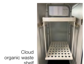
Cloud organic waste shelf