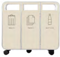
Pearl white (U15331)